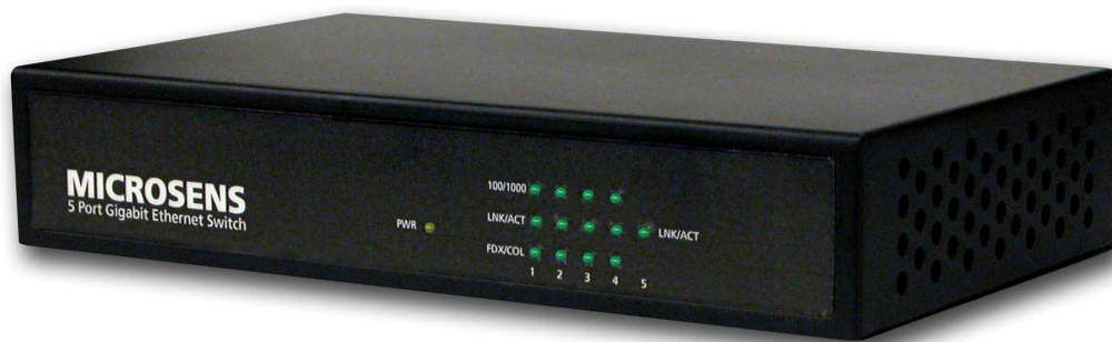
Fig. Front View